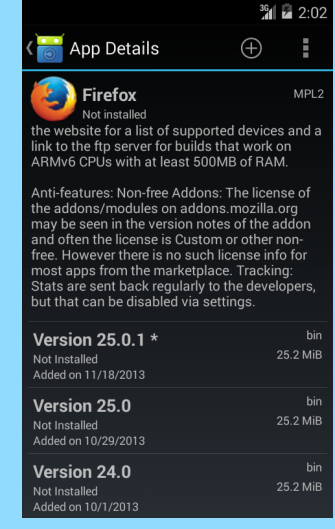
App details screen for Firefox

Pressing the menu key or depending on your device the menu button (top right corner) on an app screen gives you additional options such as the possibility to donate. Developers of free apps also like to eat, so please consider donating.