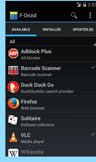
The main screen of F-Droid

F-Droid is not the typical store where you buy something. Instead, it is a catalogue (or repository) of Free Software apps. You can easily browse, search and install apps onto your device. The F-Droid app also keeps track of updates for you.